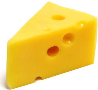
butter and cheese